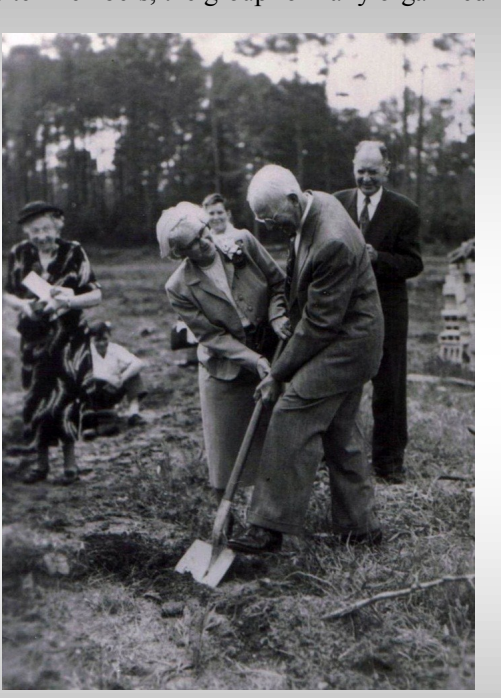
First Groundbreaking- May 3, 1953

The church has been mission oriented and has benefited from competent pastoral leadership. But most important, is the impact the church has had on the